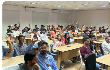
Students at Jain University (India) interested in joining Drexel (Nov 2024)