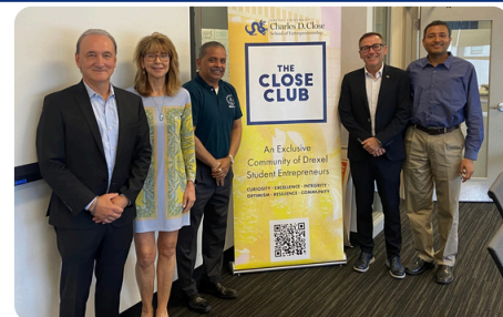
New partnership with India's #1 University, IITM with focus on Advanced Therapeutics, Advanced Materials, and Entrepreneurship (Sept 2024)

We plan to engage in Asia, Africa, and MENA next.